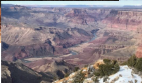
Top: Zion Nat. Park Middle: Bryce Can. Nat. Park Bottom: Grand Can. Nat. Park