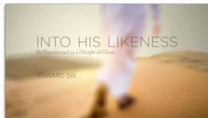
INTO HIS LIKENESS

6) 20 to 30 min. videos on what it really means to be transformed into His Likeness. Excellent for Lent!